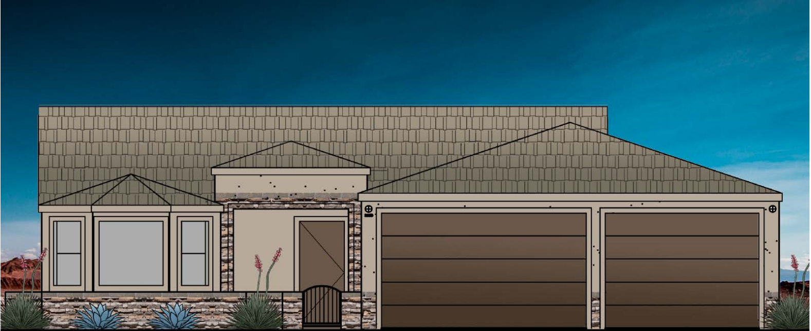
MAVERICK MODEL LEXCO CONSTRUCTION